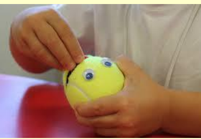
Feed the tennis ball with pennies, lids