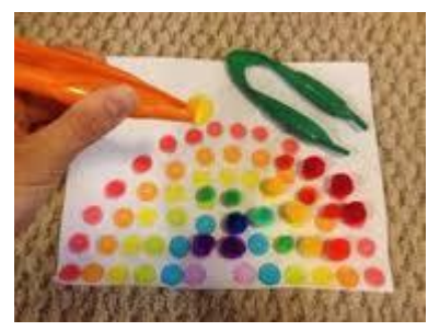
Finger dot rainbow, tweezers place pom pom balls