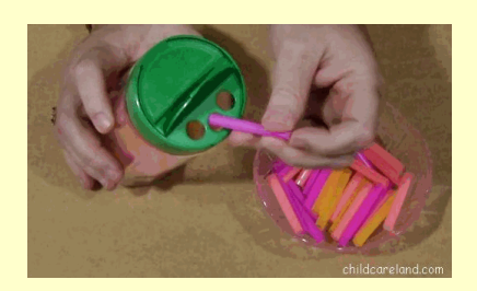
straws in parmesian bottle