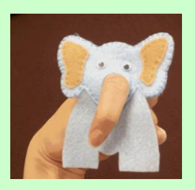
Fun foam or felt finger puppets